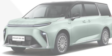
MAXUS MIFA 9 VES A | 21.8kWh/100km