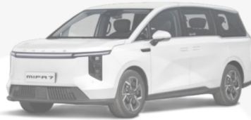
MAXUS MIFA 7 VES A | 20.9kWh/100km