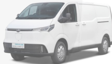
eDeliver 7 N