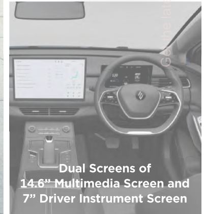
Dual Screens of 14.6" Multimedia Screen and 7" Driver Instrument Screen