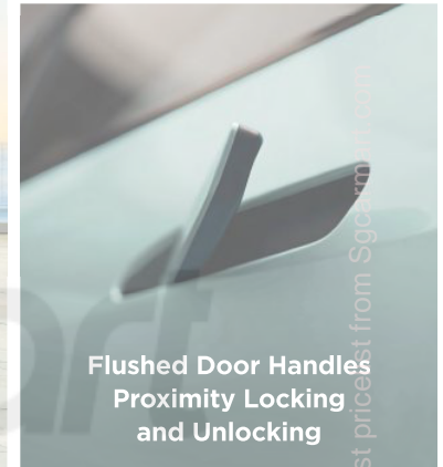
Flushed Door Handles Proximity Locking and Unlocking