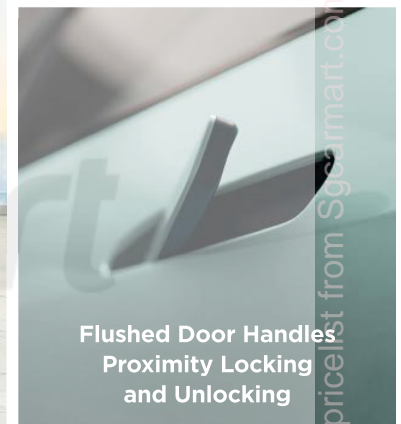
Flushed Door Handles Proximity Locking and Unlocking