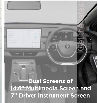
Dual Screens of 14.6" Multimedia Screen and 7" Driver Instrument Screen