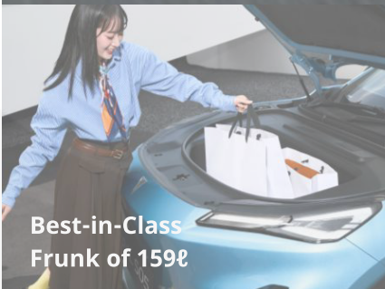
Best-in-Class Frunk of 159ℓ