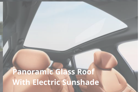
Panoramic Glass Roof With Electric Sunshade