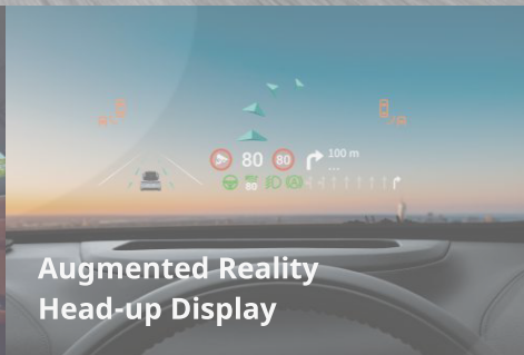
Augmented Reality Head-up Display