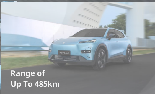
Range of Up To 485km