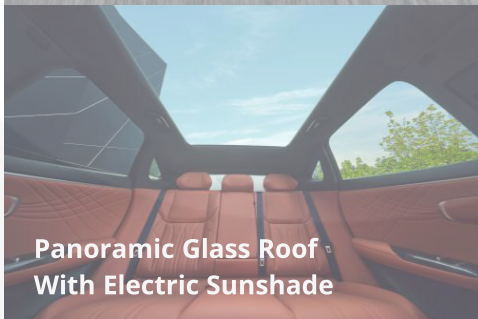
Panoramic Glass Roof With Electric Sunshade

Get the latest pricelist from Sgcarmart.com