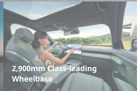
2,900mm Class-leading Wheelbase